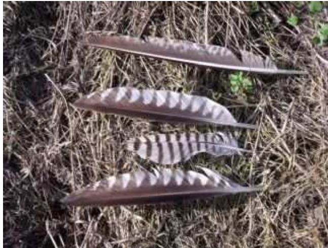
Moulted wing and tail feathers

I went down my local estuary, Findhorn Bay, this evening and there's about 300 curlews there. They are now in noticeable moult and the tideline is already peppered with moulted curlew feathers. I picked up some and photographed them. The same moult will be happening to our female curlew and her clan on the Beaulie Firth. She was at Bunchrew on 9th July, at Bunchrew to Lentrane and on the north side of the Beaulie Firth on 17th and probably on the Black Isle shore on 26th July. It will be interesting to hear if anyone sees and photographs the tagged curlew this autumn and winter.