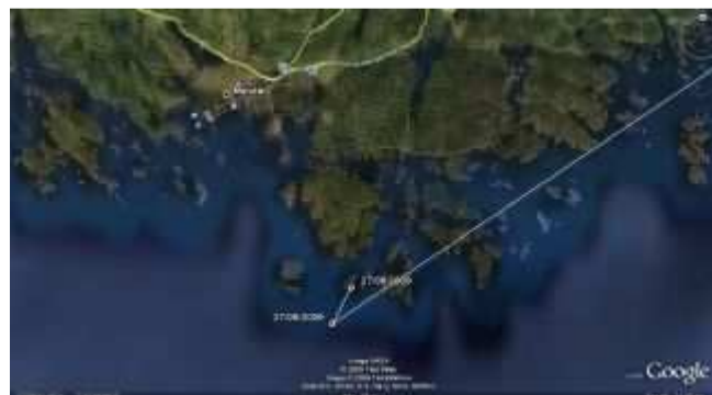
Curlew on south coast of Norway