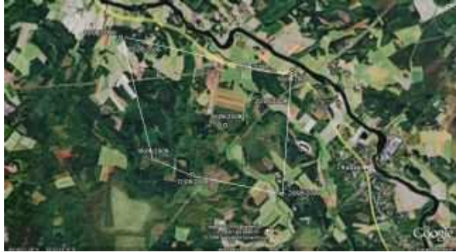
Breeding grounds near Ruukki

The curlew has been living in an area of farms, woodland and rough grounds near a small river to the east of Ruukki. Most accurate signals were within the range marked on the map, which is 3.4 kilometres east to west, and 2.7 kilometres north to south. She arrived here sometime after 4th, probably 5th May, and would most likely to have migrated with her mate from Scotland. Egg-laying and incubation is about one month, and if the eggs are successfully hatched, female curlews leave the males in charge of the growing young from 10 to 20 days after hatch.