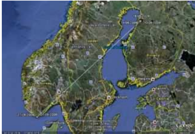
First stage of autumn migration

At 0430GMT, the curlew was on a tiny island on the very southern tip of Norway, 8 kilometres SSW of Mandal. Her migration from the breeding grounds was 1192 kilometres (742 miles). It's amazing how quickly summer is over for curlews. Unable to say whether she was in active flight during the night or stopping over on the island.