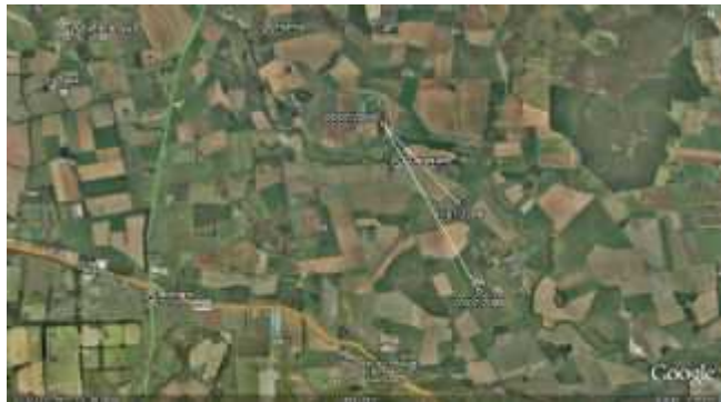
Locations near Mintlaw 1 st July