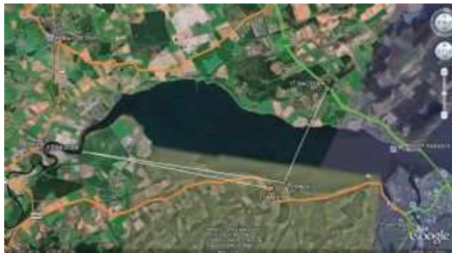
Movements in the Beaully Firth

It was a real relief that the first signal came in on 13th April, when the curlew was 7 kilometres to the west in grass or cereal fields at Wester Lovat, at the head of the Beaully Firth at high tide. On 17th April she was back at Bunchrew at 8.13 and 8.15pm. A signal at 8.29pm was 3.66 kilometres to the NNE on the Black Isle - had she started migrating at dusk or was it a low quality signal?