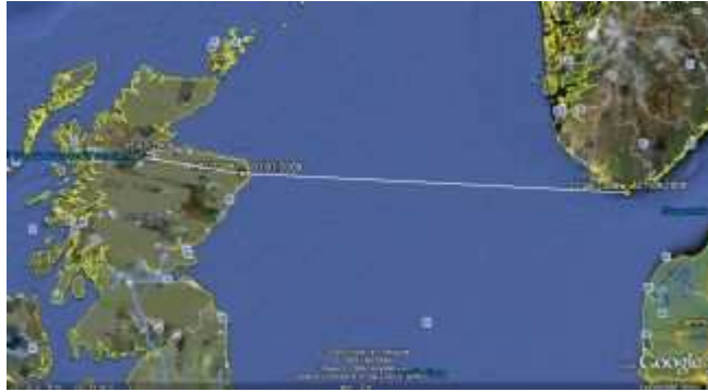
Crossing the North Sea to Aberdeenshire.