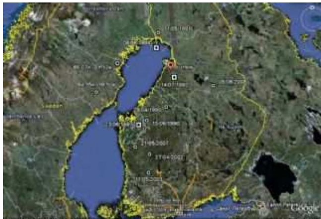
Highland Ringing Group controls and recoveries of curlews in Finland and east Sweden

This map shows three controls of curlews ringed in Finland and caught by HRG (square symbols), recoveries of curlews ringed by HRG on Moray Firth (round symbol) and the location of this tagged curlew.