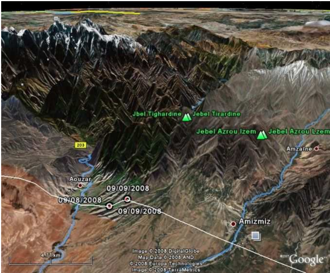
Roost in High Atlas