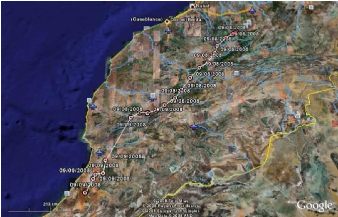
Morven's migration through Morocco 8th -9th September.