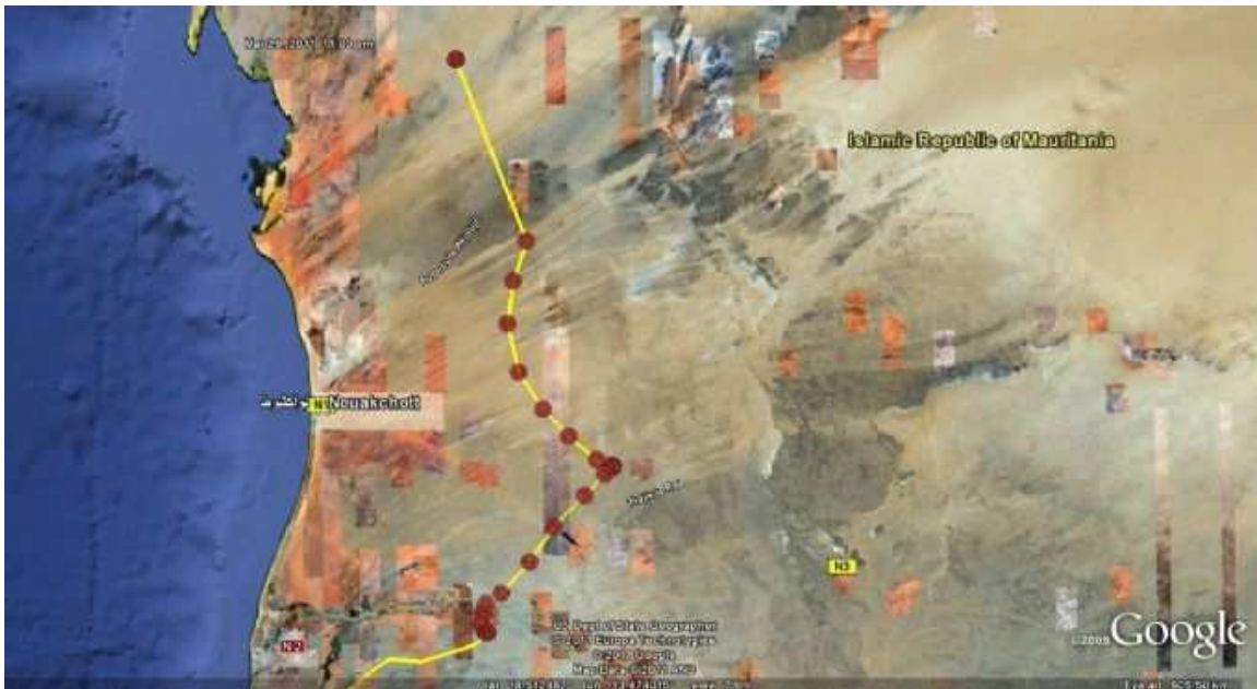
March 27 th -29 th track

On 29th, he had a slower day and made only 150 kms NNW before stopping again for the night.