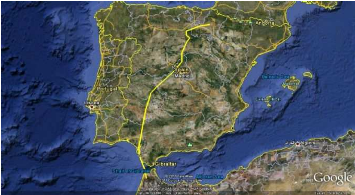
Nimrod's route through Spain: 8 th -12 th April