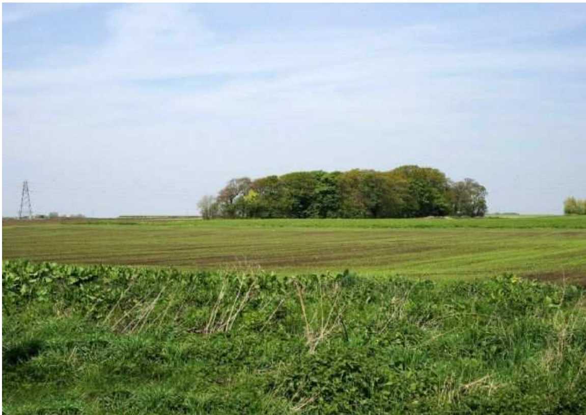
Night roost site