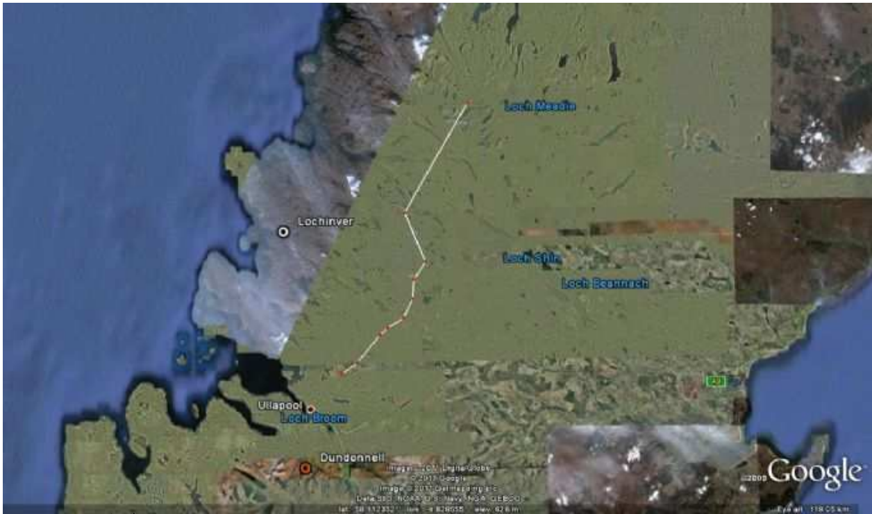
November 1 st -5 th